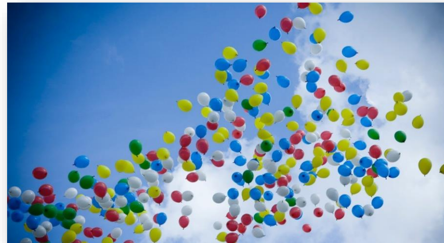
ENTSO-E 10 year (November/December)