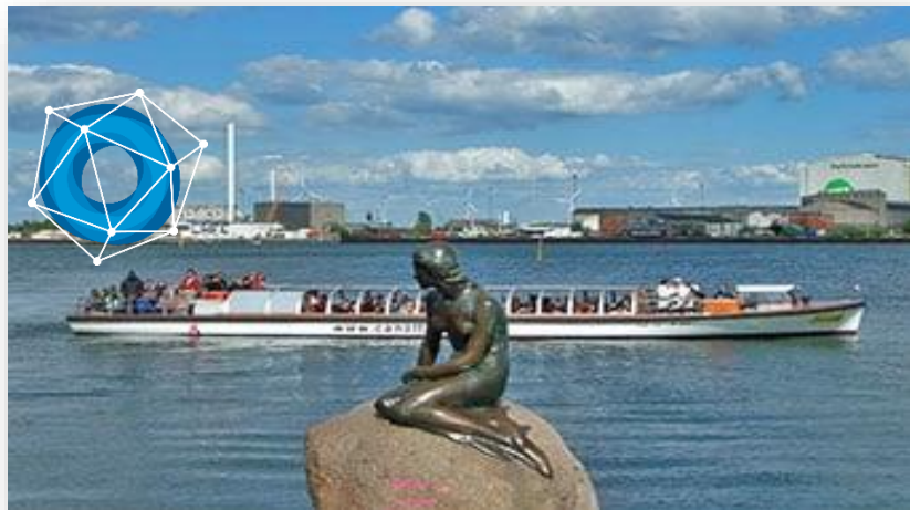
Regional coordination in Copenhagen (tbc)